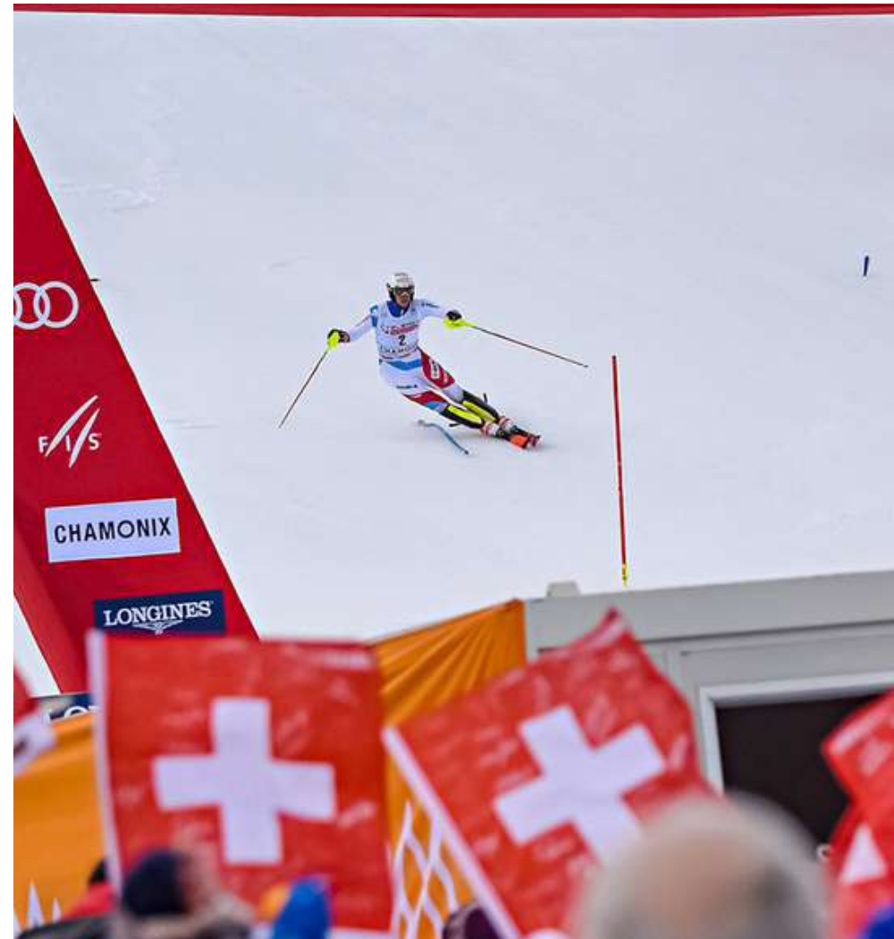
SIDE OF THE SLOPE